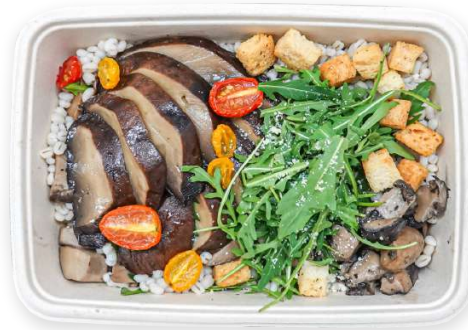
Confit Portobello Mushroom with Arugula Salad & Balsamic Dressing

Confit Portobello Mushroom Arugula Salad with Barley, Sauteed Wild Mushroom, Sundried Tomato, Pine Nut, Garlic Crouton, Parmesan Cheese, Balsamic Dressing