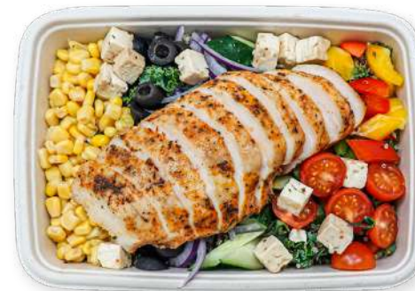
Mediterranean Chicken Quinoa Salad

Confit Chicken Breast with Dukkah Spiced Chick Pea & Quinoa Bowl with Locally Farmed Kale, Corn Kernel, Spanish Onion, Cherry Tomato, Marinated Olive, Japanese Cucumber, Tahini Dressing