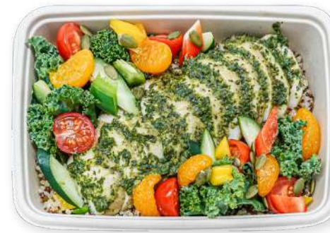
Locally Farmed Kale Salad with Pesto Chicken Breast

Confit Portobello Mushroom Arugula Salad with Barley, Sauteed Wild Mushroom, Sundried Tomato, Pine Nut, Garlic Crouton, Parmesan Cheese, Balsamic Dressing