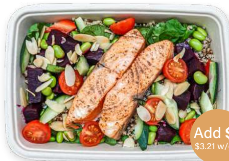
Quinoa & Edamame Salad with Confit Atlantic Salmon

Boneless Bulgogi Chicken Leg Marinated Kim Chi with Cabbage Slaw, Lettuce, Carrot, Edamame, Cherry Tomato, Spring Onion, Sesame Seeds