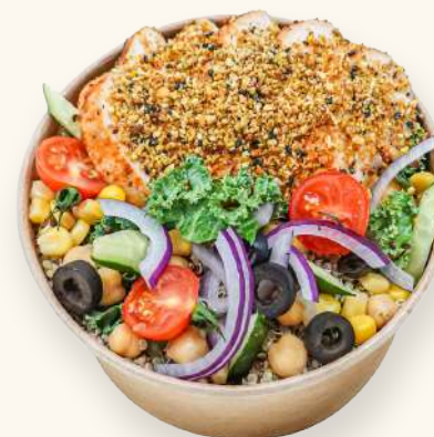
Chick Pea & Quinoa Bowl with Dukkah Chicken Breast

Confit Atlantic Salmon Organic Quinoa Salad with Baby Spinach, Pickle Beetroot, Edamame, Japanese Cucumber, Toasted Almond Flakes, Goma Dressing