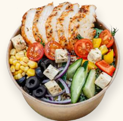
Mediterranean Chicken Quinoa Salad

Confit Chicken Breast with Dukkah Spiced Chick Pea & Quinoa Bowl with Locally Farmed Kale, Corn Kernel, Spanish Onion, Cherry Tomato, Marinated Olive, Japanese Cucumber, Tahini Dressing