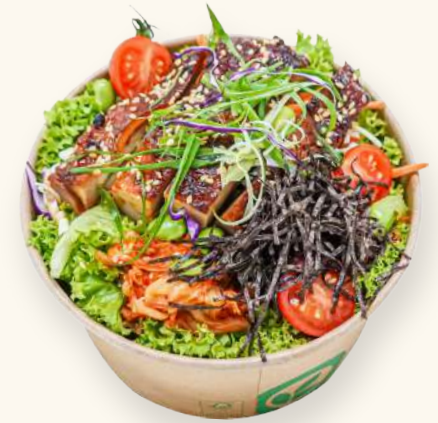
Korean Kim Chi Salad with Bulgogi Chicken

Sous Vide Pesto Chicken Breast Locally Farmed Kale Salad with Organic Quinoa, Orange Segment, Cherry Tomato, Japanese Cucumber, Bell Pepper, Toasted Pumpkin Seeds & Citrus Dressing