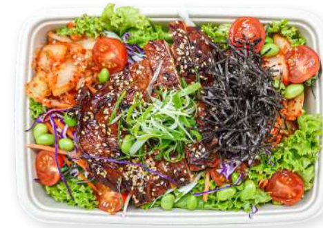
Korean Kim Chi Salad with Bulgogi Chicken

Sous Vide Pesto Chicken Breast Locally Farmed Kale Salad with Organic Quinoa, Orange Segment, Cherry Tomato, Japanese Cucumber, Bell Pepper, Toasted Pumpkin Seeds & Citrus Dressing