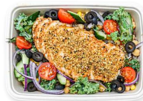
Chick Pea & Quinoa Bowl with Dukkah Chicken Breast

Confit Chicken Breast with Dukkah Spiced Chick Pea & Quinoa Bowl with Locally Farmed Kale, Corn Kernel, Spanish Onion, Cherry Tomato, Marinated Olive, Japanese Cucumber, Tahini Dressing