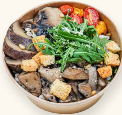
Confit Portobello Mushroom with Arugula Salad & Balsamic Dressing

Confit Portobello Mushroom Arugula Salad with Barley, Sautéed Wild Mushroom, Sundried Tomato, Pine Nut, Garlic Crouton, Parmesan Cheese, Balsamic Dressing