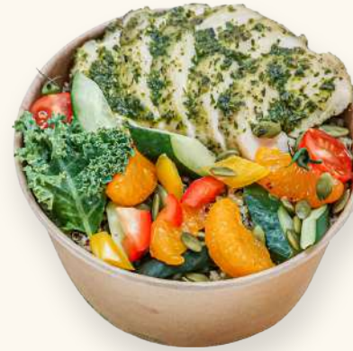
Locally Farmed Kale Salad with Pesto Chicken Breast

Confit Portobello Mushroom Arugula Salad with Barley, Sautéed Wild Mushroom, Sundried Tomato, Pine Nut, Garlic Crouton, Parmesan Cheese, Balsamic Dressing